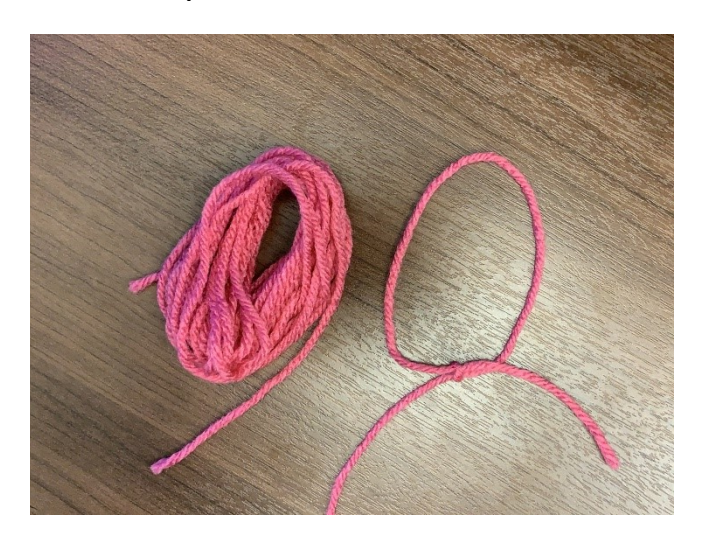
Step 4 Take the loose ends of your loop and tie around the top of your main tassel piece (the piece you wrapped around your fingers and set aside). Double knot these loose ends also.