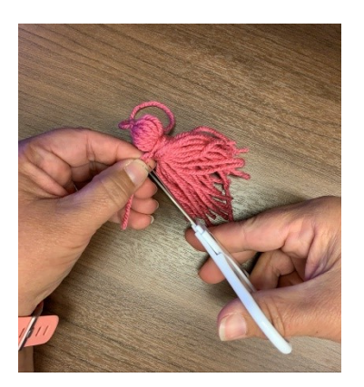
Step 7 Trim the bottom of the tassel.