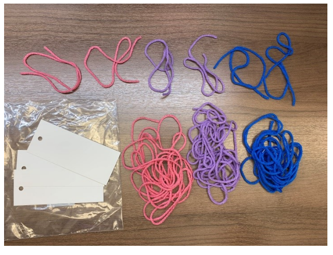
3 Plain bookmarks and 9 pieces of yarn are included in the take home craft kit.