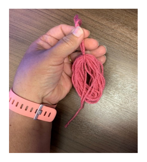
Step 5 At the other end of your main tassel piece, cut the yarn so that it is no longer looped.